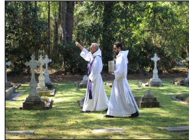
Every November the monks bless the cemetery on All Souls' Day.

Individual plots are $4,900; price includes perpetual care. Grave markers must be purchased through Saint Joseph Abbey. (Prices are subject to change.)