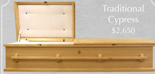
Traditional Cypress $2,650

A Benedictine cross is engraved on the side of each casket. View caskets online at www.saintjosephabbey.com/caskets