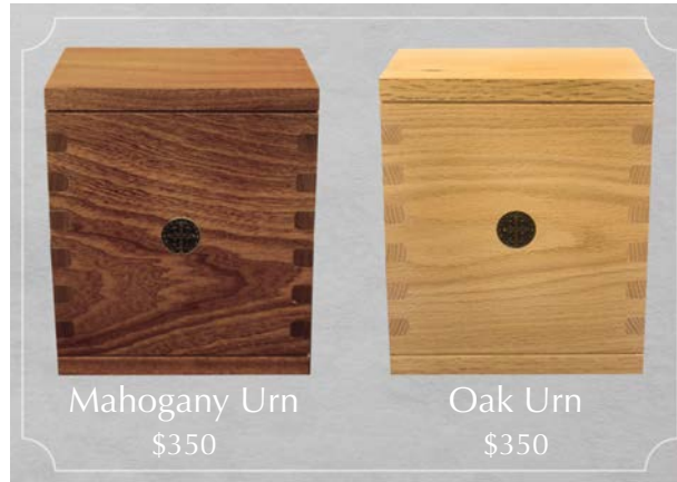
Mahogany Urn $350