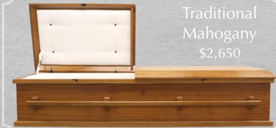
Traditional Mahogany $2,650